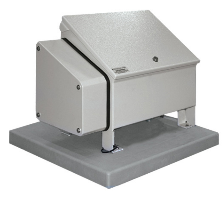
Options: Sound kits, Shallow Water AirStations and VBS remote valve boxes

Vertex diffused aeration systems are super-efficient, affordable and safe. The rising force of millions of bubbles transports bottom water to the surface, allowing oxygen to be absorbed and circulating the entire water column.